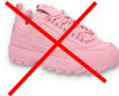
NO FASHION TRAINER